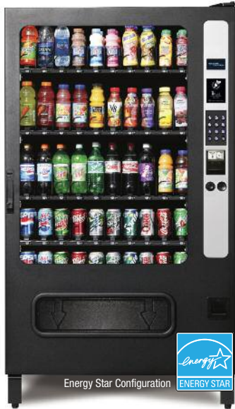
Alpine ST5000 Shown with optional styling panel and iCart touch screen.