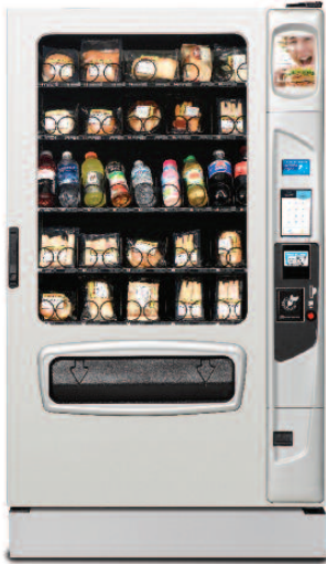
Shown in platinum with optional iCart interface & kick panel.