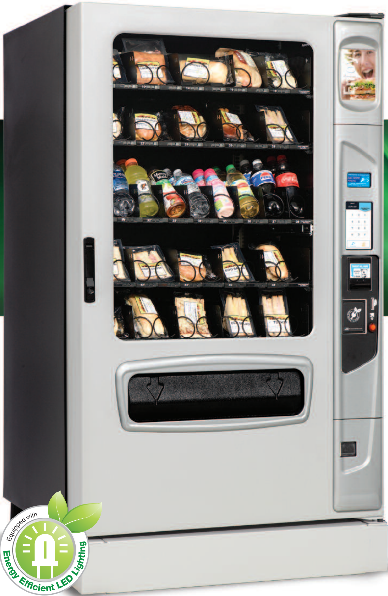
Shown with platinum door styling, iCart touch screen and kick panel options.

The Alpine 5000 Elevator is the latest version of USI's class leading glass front food & beverage merchandiser and is designed to gently serve a wider variety of prepackaged meals, sandwiches, salads, dairy, fresh fruit & beverages.