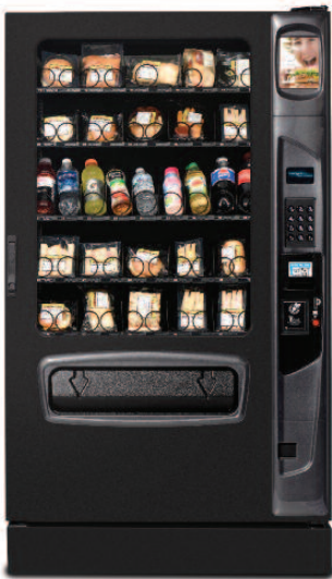
Shown in black with motor pairing and kick panel options.

Note: Not compatible with satellite food or beverage vendors.