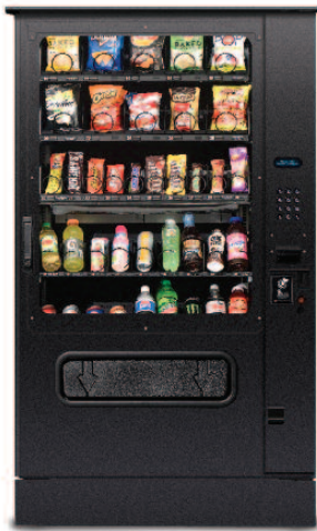
Shown with optional kick panel.