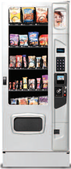
Shown with silver door color & kick panel options.