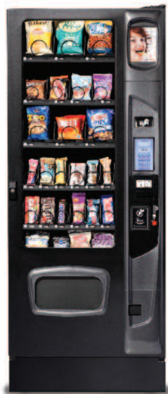
Shown with iCart touch screen & kick panel options.