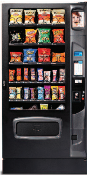
M4000 Shown with iCart touch screen & kick panel options.