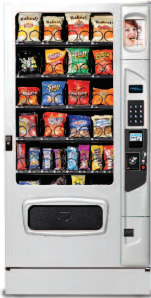
M4000 Shown with platinum door color & kick panel options.