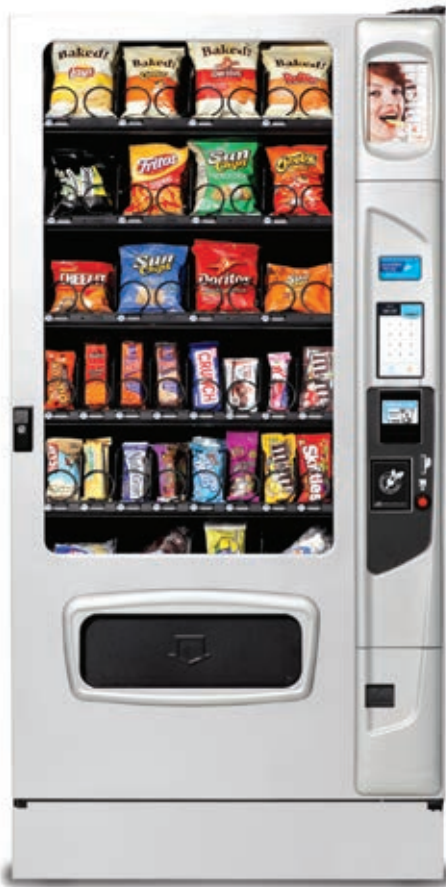
Shown with optional iCart/FLEX and kick panel options. Available with Black door.