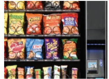
Shown with optional 7th Tray, optional 10.1" Touch Screen and standard Leg Covers

633 Items (6 Tray) (252 Snack-Pastry/381 Candy) 773 Items (7 Tray) (296 Snack-Pastry/477 Candy)