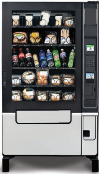
Evoke Elevator Food

Shown with standard 3.5" Display, Braille Identified Keypad and Leg Covers