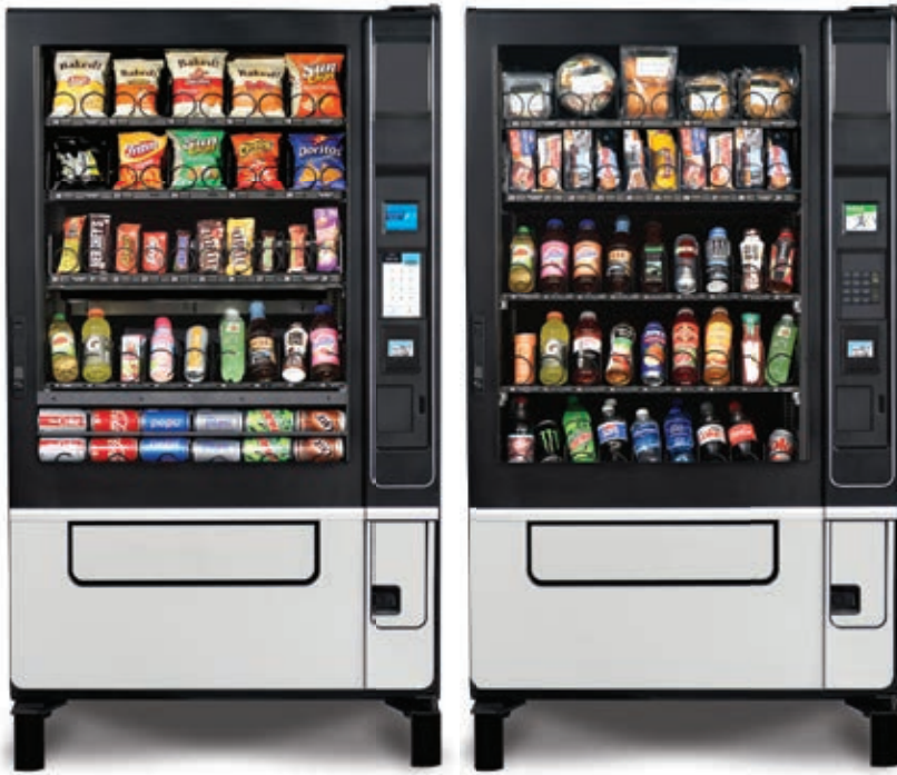
Evoke Combo 5 (ST Snack Config)

Shown with optional High Capacity Can Tray, optional 7" Touch Screen and standard Leg Covers