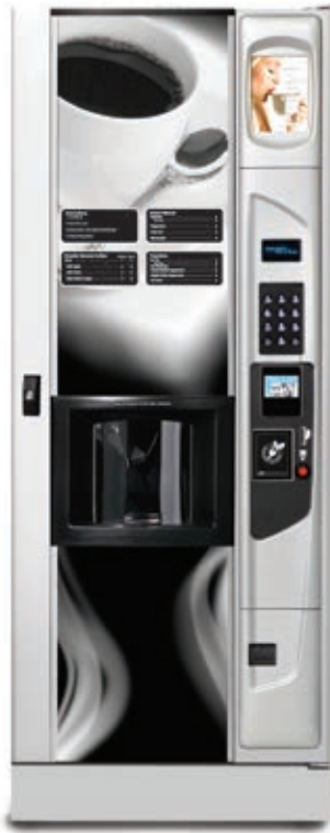
Shown with Platinum Silver door and Kick Panel option Available with Black door.