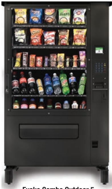
Evoke Combo Outdoor 5 (ST Snack Config)