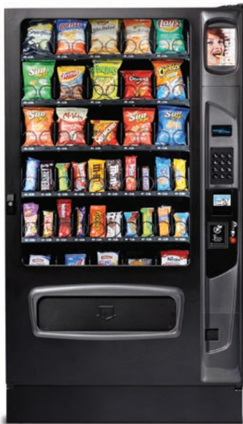
Shown with optional kick panel. Available with Platinum Silver door.