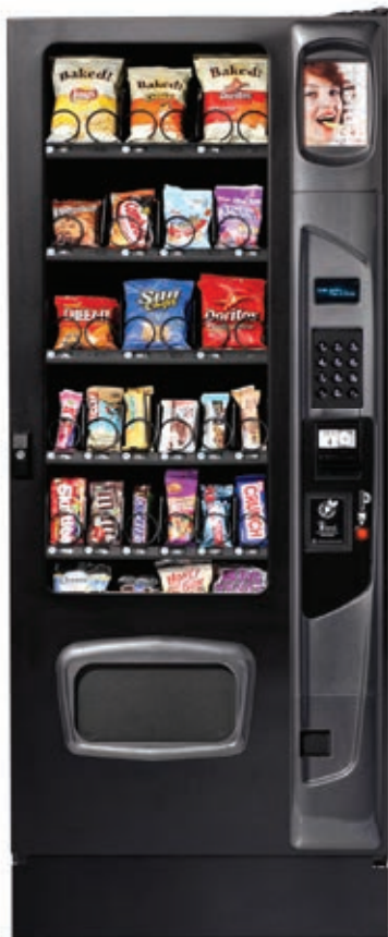
Shown with optional kick panel. Available with Platinum Silver door.