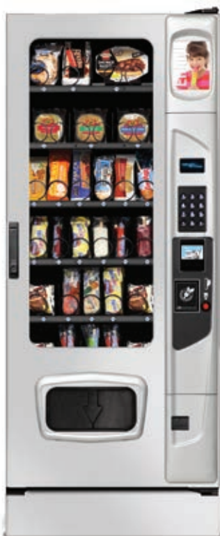
Shown with Platinum Silver door and Kick Panel option Available with Black door.