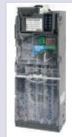
Conlux MCM5 Series