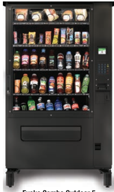
Evoke Combo Outdoor 5 (ST Food Config)

Shown with standard 3.5" Display, Braille Identified Keypad and Leg Covers