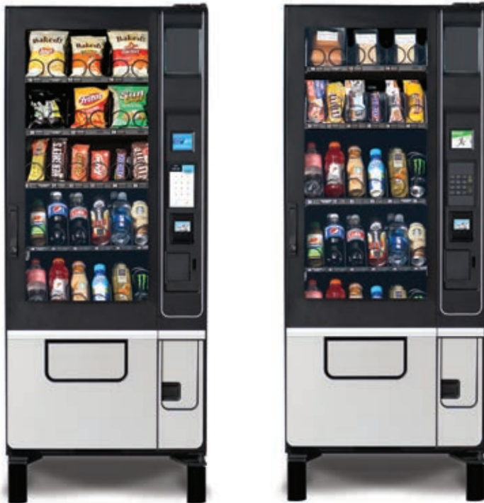
Evoke Combo 3 (ST Snack Config) Evoke Combo 3 (ST Food Config)

Shown with optional 7" Touch Screen and standard Leg Covers