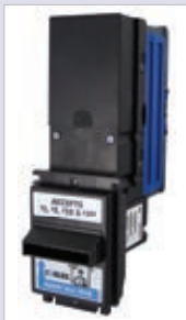
Conlux CV 1000 Series

Other cash & credit payment systems including international are available. Please contact U-Select-It for quote.