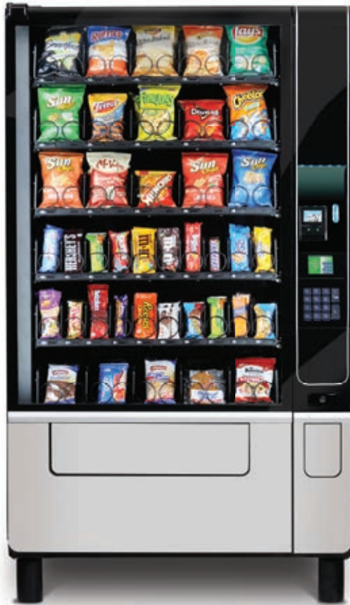
Shown with standard 3.5" Display, Braille Identified Keypad and Leg Covers