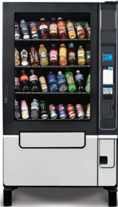
Evoke Elevator Cold Beverage Shown with optional 7" Touch Screen and standard Leg Covers