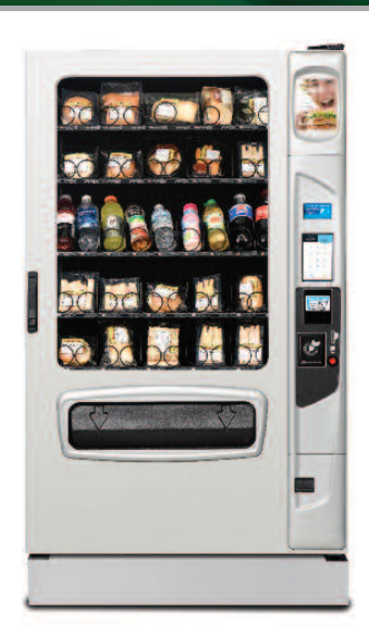
Shown in platinum with optional iCart interface & kick panel.