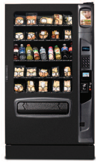
Shown in black with motor pairing and kick panel options.

Note: Not compatible with satellite food or beverage vendors.