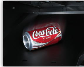
Guaranteed Delivery Sensor System

Keeps customers satisfied and reduces service calls for misloaded product.