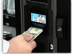
Premium Currency Acceptors Includes standard electronic coin acceptor and $1, $5, $10 & $20 bill acceptor (Set for $1 & $5)