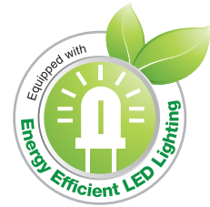
Energy Saving LED Lighting Enhances product presentation promoting more sales. No bulb servicing for 5 years. Energy efficient and eco-friendly.