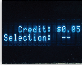
Vacuum Fluorescent Display With point of sale message and credit display options.