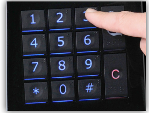
Large Braille Identified Keypad

Keeps customers satisfied and reduces service calls for misloaded product.