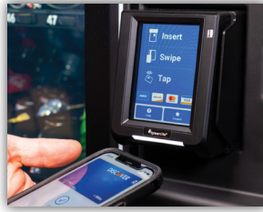
Credit/Debit & mobile reader options.