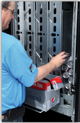
Easy Loading Product Stacks Double deep for high capacity. Built-in case support rack helps speed loading.