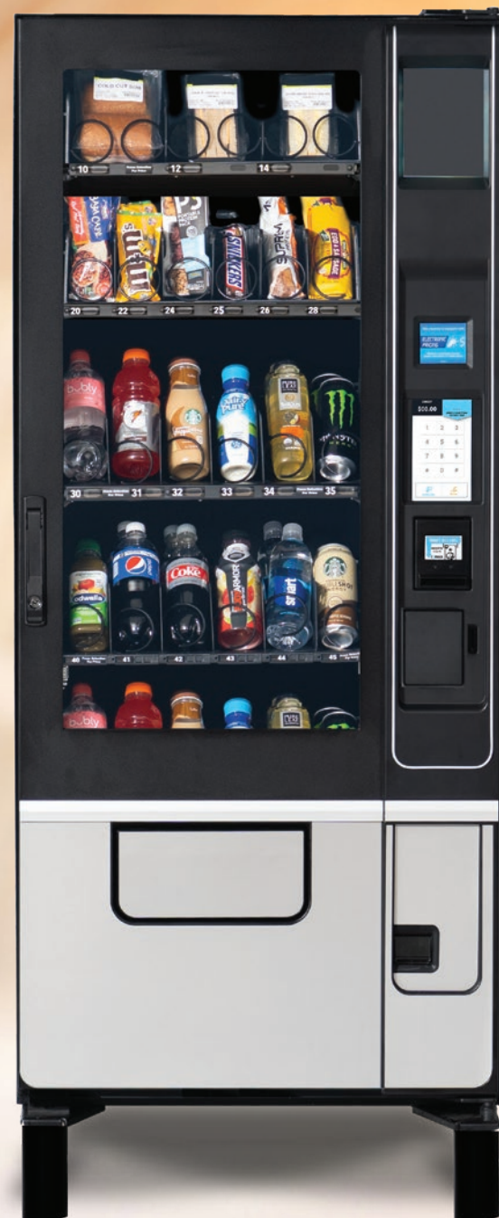
Evoke ST3 shown with optional 7" Touch Screen and standard Leg Covers

The refrigerated merchandiser designed for performance and built to last