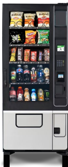
Evoke VT3 shown with standard 3.5" Display, Braille Identified Keypad and Leg Covers