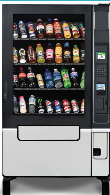
Shown with standard 3.5" Display, Braille Identified Keypad and Leg Covers