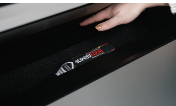
ADA Delivery Bin