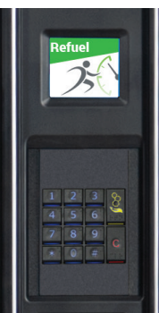
Braille Keypad Standard