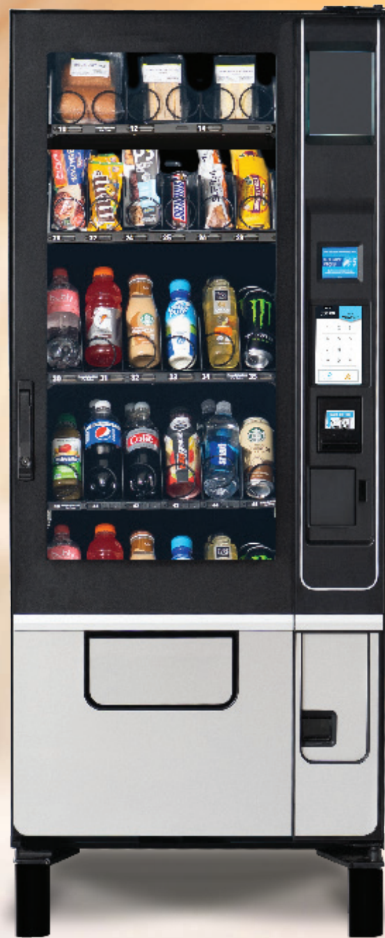
Evoke ST3 shown with optional 7" Touch Screen and standard Leg Covers

The refrigerated merchandiser designed for performance and built to last