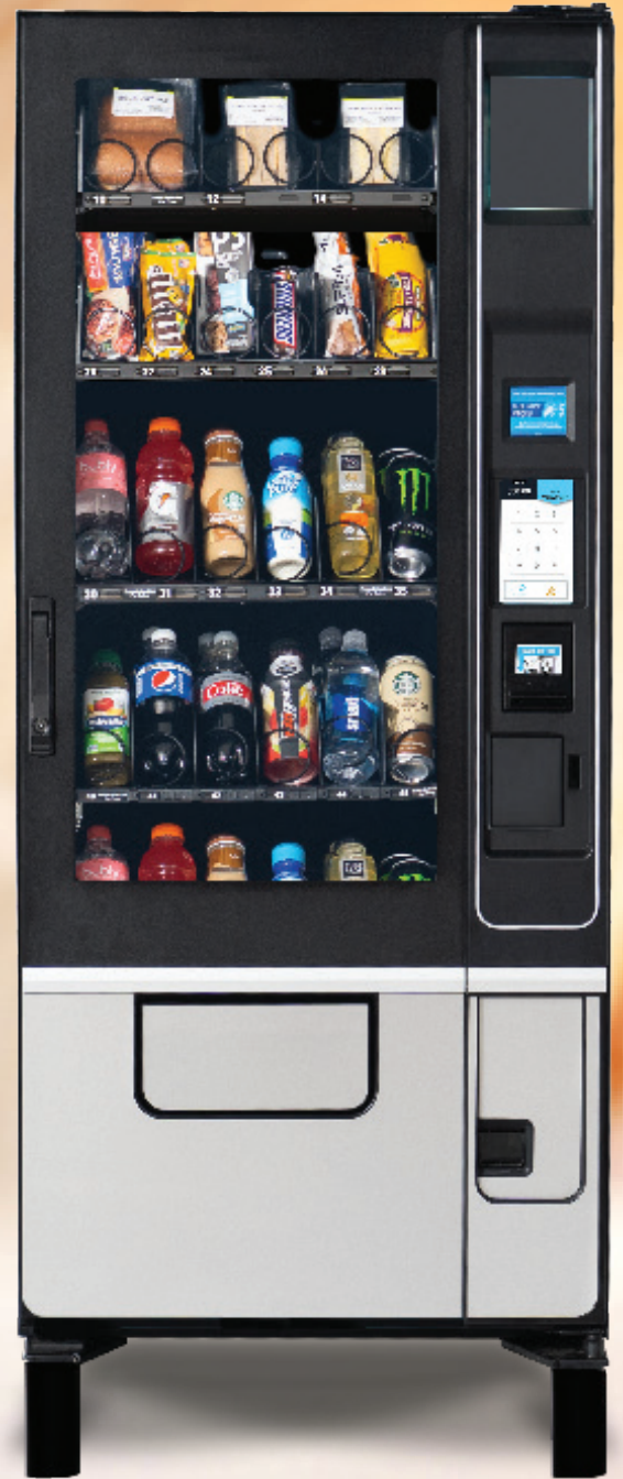
Evoke ST3 shown with optional 7" Touch Screen and standard Leg Covers

The refrigerated merchandiser designed for performance and built to last