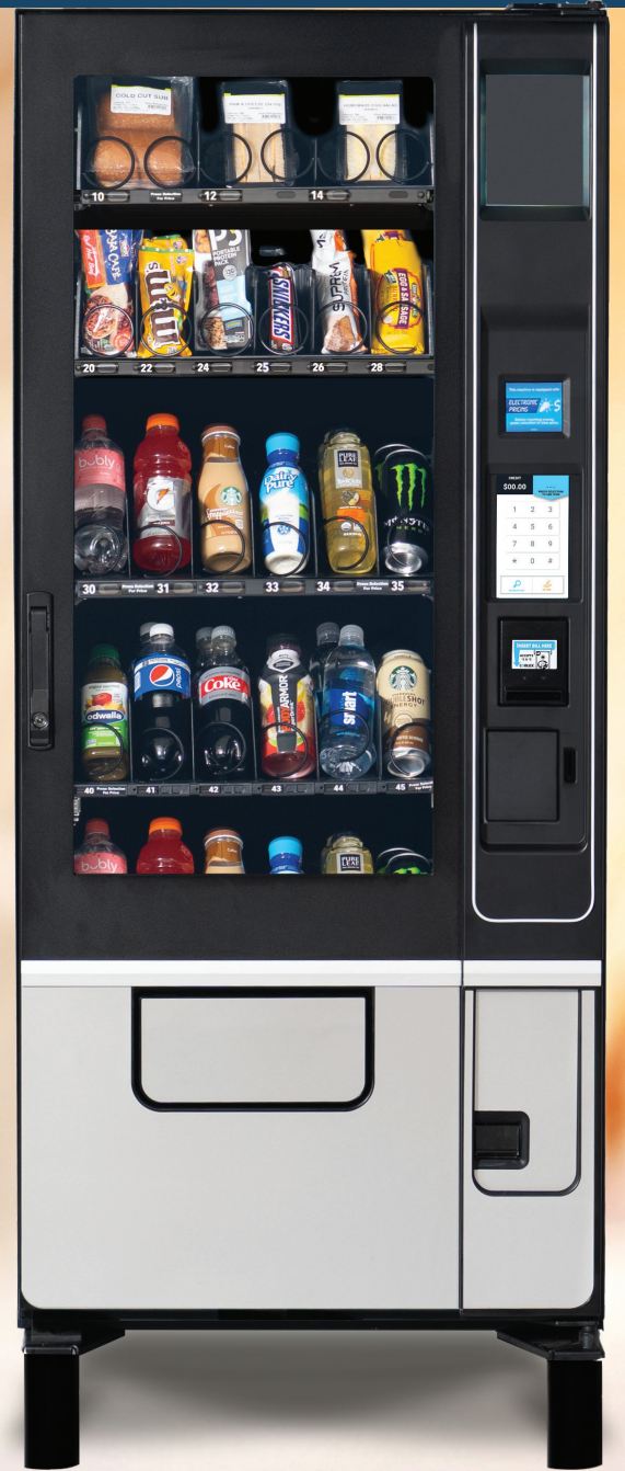
Evoke Combo ST3 shown with optional 7" Touch Screen and standard Leg Covers

The refrigerated merchandiser designed for performance and built to last