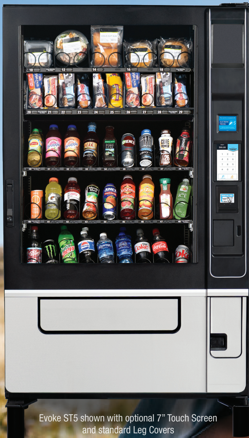
Evoke ST5 shown with optional 7" Touch Screen and standard Leg Covers