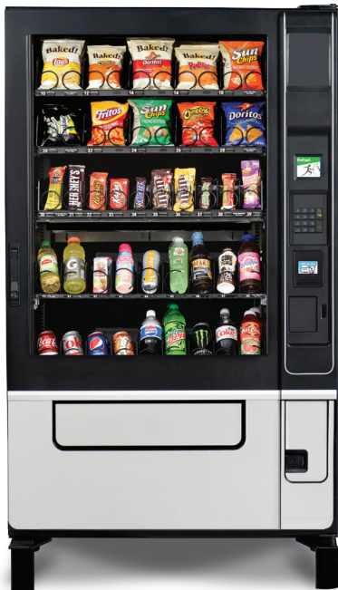
Evoke VT5 shown with standard 3.5" Display, Braille Identified Keypad and Leg Covers