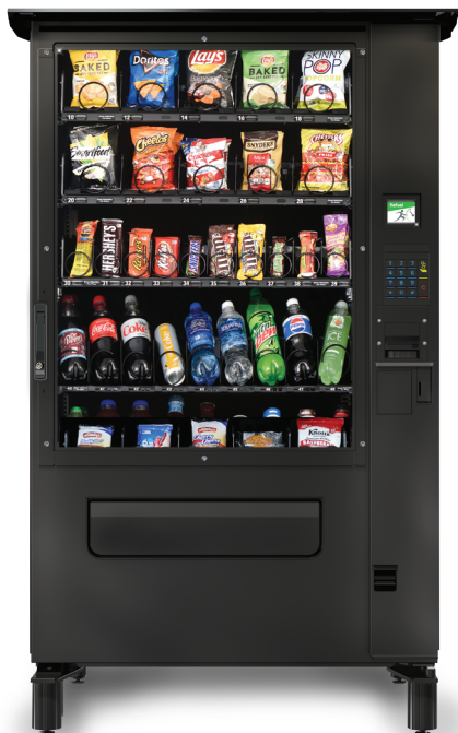
Evoke Outdoor (VT)