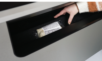
Sell Salads, Sandwiches and more!