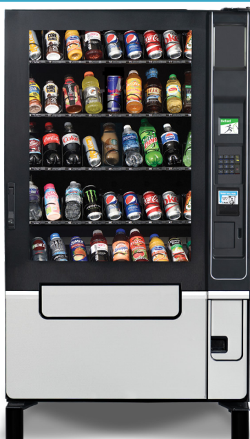
Shown with standard 3.5" Display, Braille Identified Keypad and Leg Covers