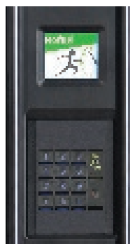
Braille Keypad Standard