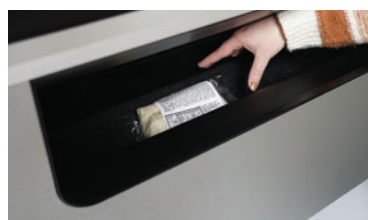
Sell Salads, Sandwiches and more!