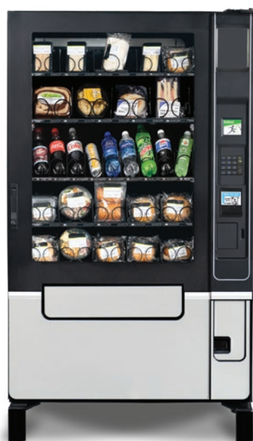
Shown with standard 3.5" Display, Braille Identified Keypad and Leg Covers