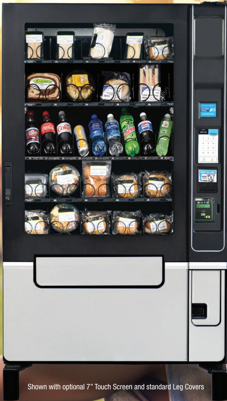
Shown with optional 7" Touch Screen and standard Leg Covers