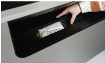
Sell Salads, Sandwiches and more!