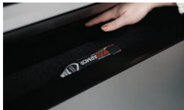
ADA Delivery Bin