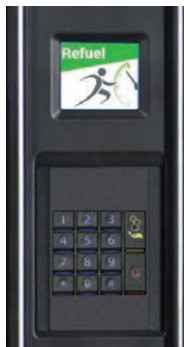
Braille Keypad Standard