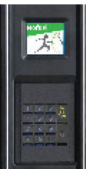
Braille Keypad Standard