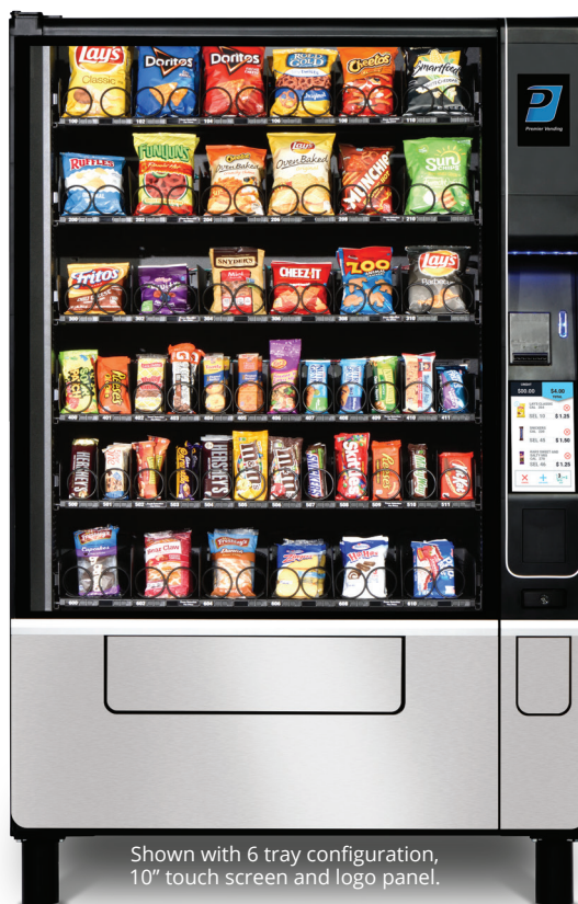
Shown with 6 tray configuration, 10" touch screen and logo panel.