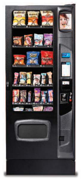
Shown with iCart touch screen & kick panel options.

Shown with platinum door color & kick panel options.