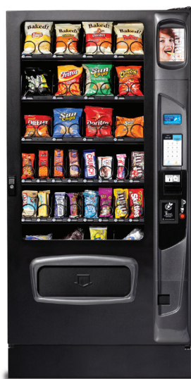
Mercato 4000 Shown with iCart touch screen and kick panel options.