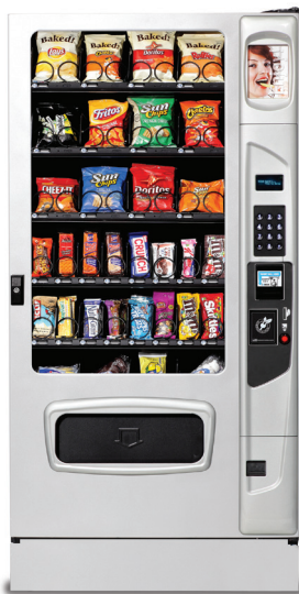
Mercato 4000 Shown with platinum door styling and kick panel options.