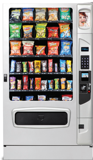
Mercato 5000 Shown with platinum door styling and kick panel options.