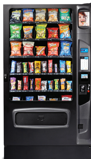
Mercato 5000 Shown with iCart touch screen and kick panel options.