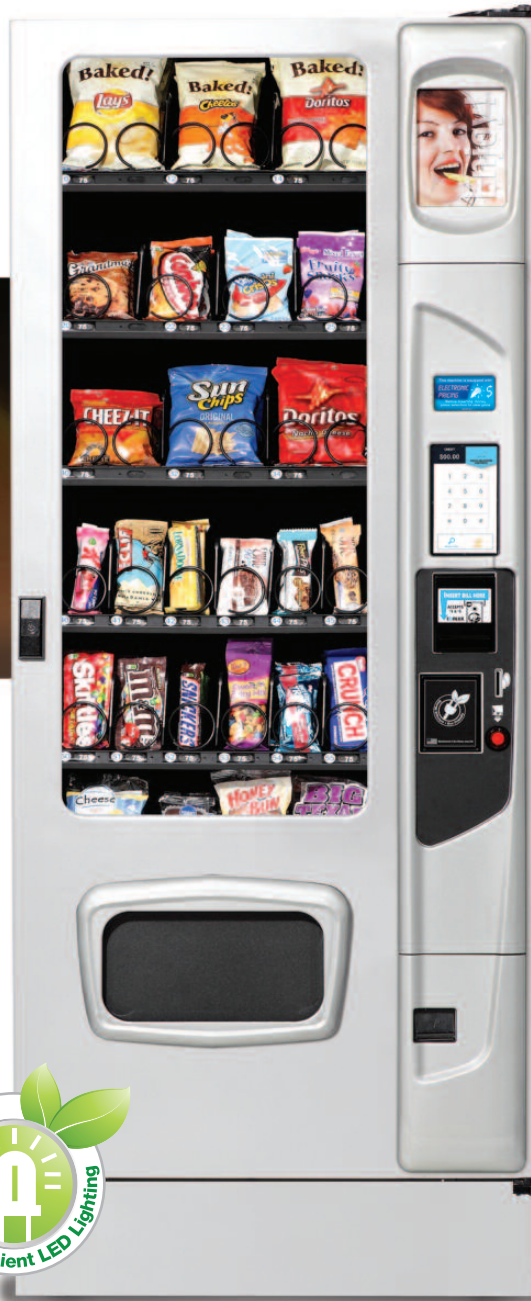
Shown with platinum door styling, iCart touch screen and kick panel options.

The Mercato 3000 glass front snack merchandiser incorporates all the proven features you expect in a new design and includes additions that increase the value for choosing USI.