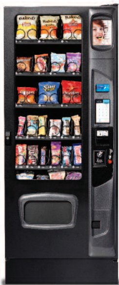
Shown with iCart touch screen & kick panel options.