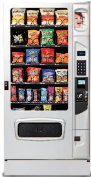
M4000 Shown with silver door color & kick panel options.