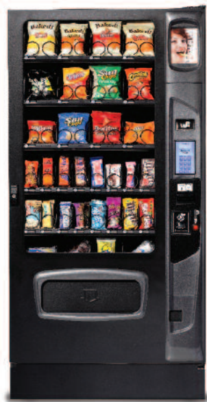
M4000 Shown with iCart touch screen & kick panel options.