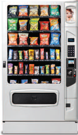
M5000 Shown with silver door color & kick panel options.