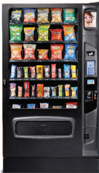
M5000 Shown with iCart touch screen & kick panel options.