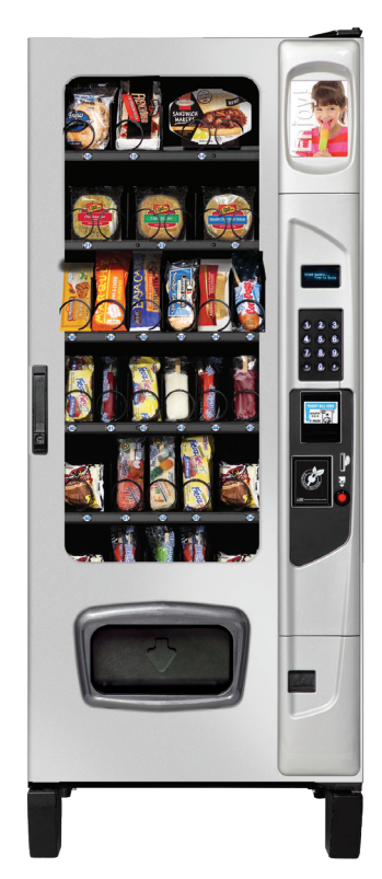
Shown with platinum silver door. Available with black door.