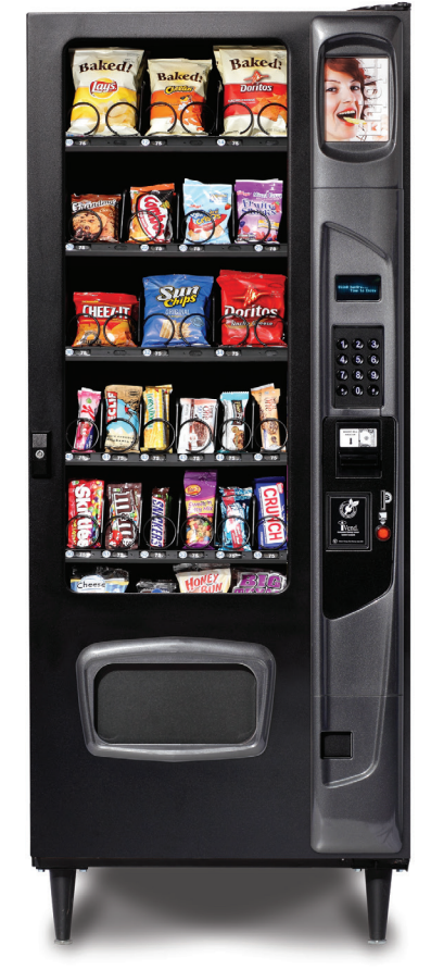
Available with platinum silver door.