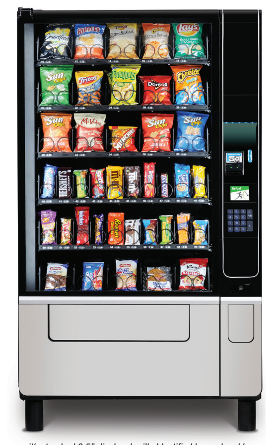
Shown with standard 3.5" display, braille Identified keypad and leg covers.