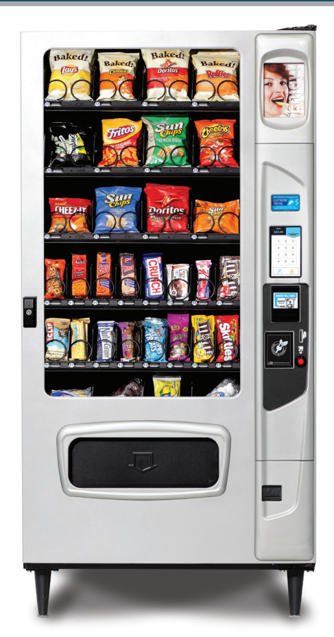
Shown with optional 7" touch screen. Available with black door.